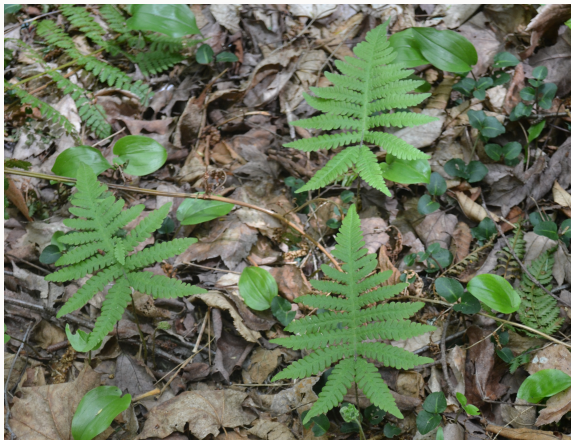
You can find many ferns, such as Long Beechfern, growing in rich, moist woodlands.